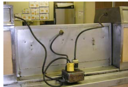
Figure 3: The outlet for the heat lamps is on the back of the fryer. The heat modules should be mounted with the cord facing the middle of the fryer. Power for the outlet is routed from a breaker box in the fryer cabinet. The breakers must be at least 20 amps.